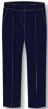
Girls Navy trouser