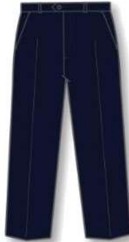
Boys Navy trouser