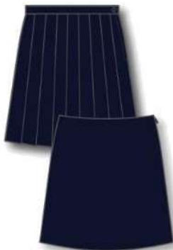
Navy pleated & straight skirts