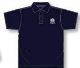
Navy Classic polo