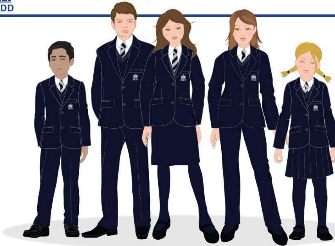
Girls Navy Aspire Jacket